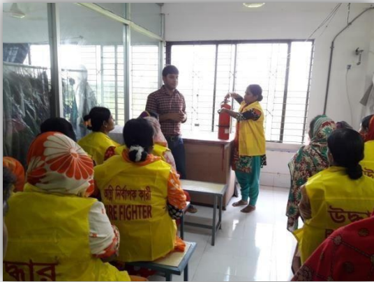
Trained Fire Fighting & Rescue Team