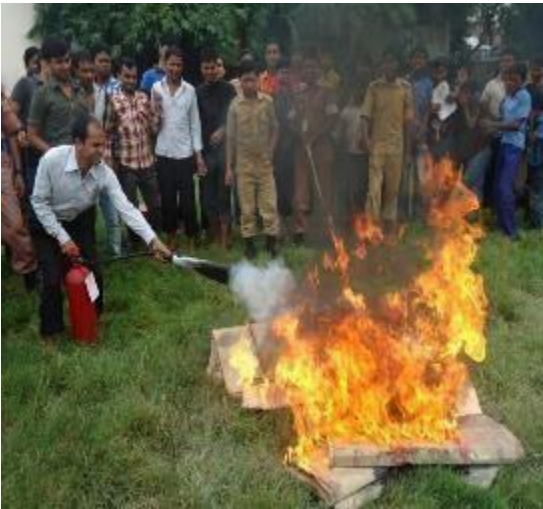
Fire Extinguishing Training