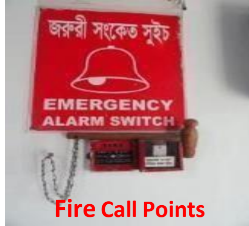
Fire Call Points