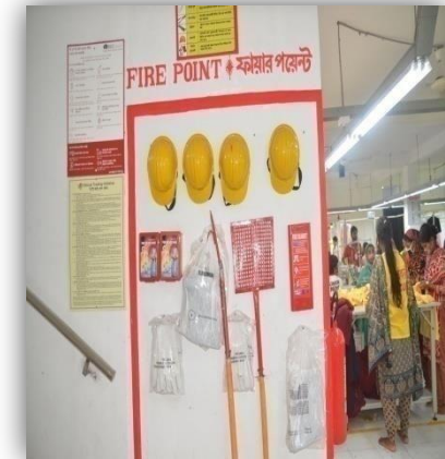
Fire Fighting Equipment